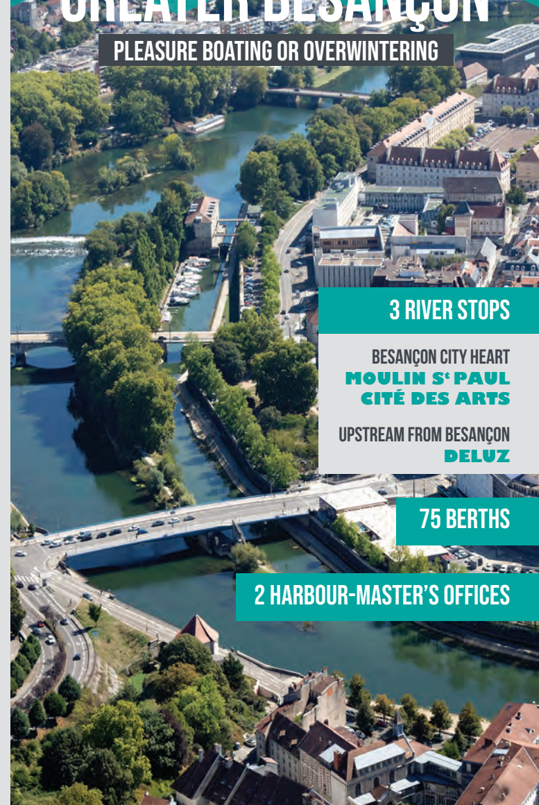
Direction de la Communication du Grand Besançon - Photo de couverture : 4verts - Impprimerie municipale - Février 2019